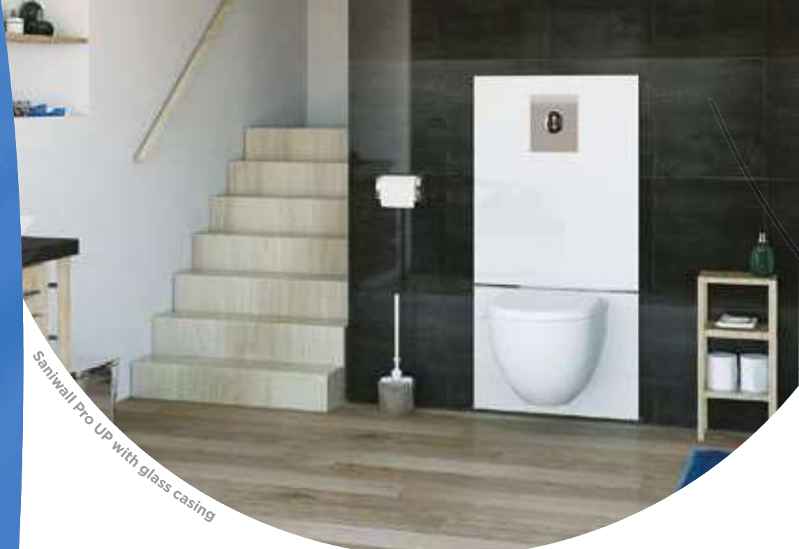
Saniwall Pro UP with glass casing

Glass-clad version EAN 3308815074115 WALLPROUPSTD