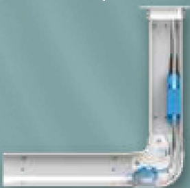
Sanicondens Clim pack S

Sanicondens Clim mini S comes with an anti-drain vacuum breaker as standard