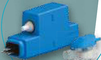
Sanicondens Clim mini S

Sanicondens Clim mini S comes with an anti-drain vacuum breaker as standard