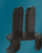
Floating ring seal provided.