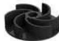
KX V6 Vortex Wheel