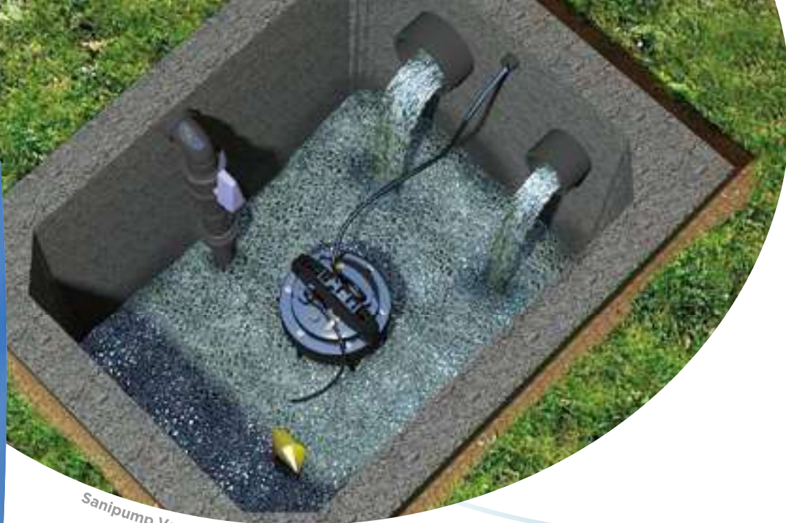
Sanipump Vortex installed in a sump

Sanipump Single-phase Vortex EAN 3308815076201 POMPIMMERGEVORTEX