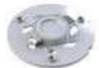
Pro X K2 knife